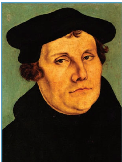
Portrait of Martin Luther by Lucas Cranach the Elder (1472-1553). 1529.

Martin Luther's deep engagement with Scripture caused the Lutheran Reformation. Writing in 1545, a year before his death, Luther recalled how his meditation on Romans 1:17 had affected him. The words of the apostle Paul, "He who through faith is righteous shall live," led Luther to a new understanding of the righteousness or justice of God. Luther remembered that "a totally other face of the entire Scripture showed itself to me." He no longer saw God's righteousness as the righteousness by which God judges us but rather as the way God justifies us, that is, puts us in right relationship with God.