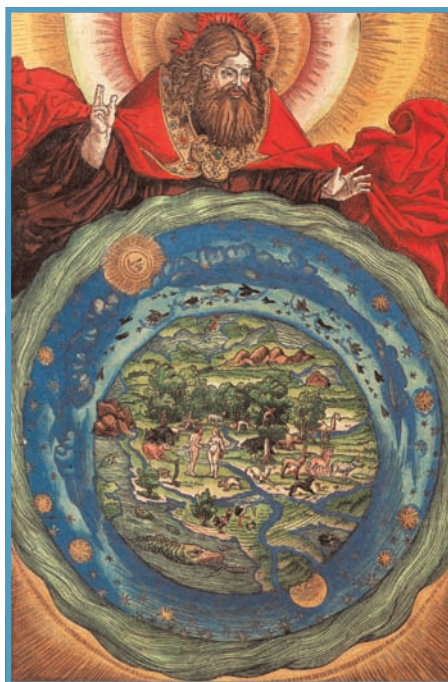
Genesis. Fontispiece Depicting the Creation, From the Luther Bible, 1st edition, 1534.

Where is the Word then? Luther believed that all humanity, all institutions, including the church, are affected by the hurly-burly of events and infected with sin. God’s Word is mingled with and hidden under the forces that oppress the church at all times and places. God’s Word is realized in the community of faith only because the Word itself acts in us. It forms in us confession of faith, a loving response to divine grace. Although that has been true from Adam to the present day, knowledge and proper understanding of God’s Word are not a continuous, unbroken achievement of the church. Rather, our knowledge of God is best understood as God’s gift, which draws the spontaneous response of the Christian community to the gospel. It is a response created within the hearts of believers by the Holy Spirit’s work in the Word. God, not doctrinal propositions, a pope, or a succession of bishops, provides faithfulness in the church. Therefore, under the guidance of the Spirit, responsible faith requires critical discernment of the text of Scripture, not just listening to the traditions of the church. 6