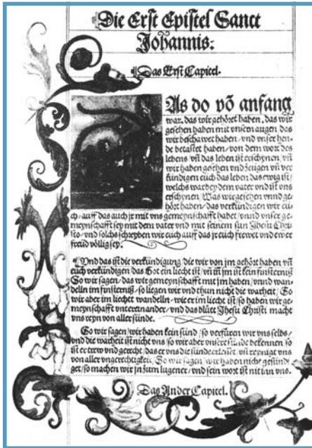
Facsimile of a page of the New Testament printed in 1523.

The gospel is the gracious promise of God in Christ. It grants forgiveness of sin, life, and salvation to the fallen and unworthy sinner. To read the Bible with the gospel as its heart is to "urge Christ" in each biblical text. "The Scriptures," Luther stated, "must be understood in favor of Christ, not against him. For that reason they must either refer to him or must not be held to be true Scriptures." And again: "If one of them had to be parted with, Christ or the law, the law would have to be let go, not Christ."